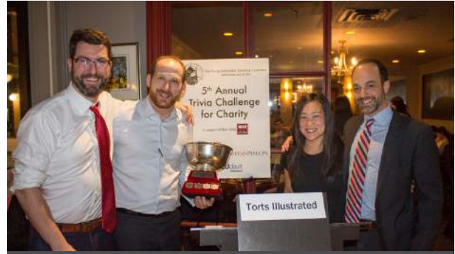
"Torts Illustrated" from Dutton Brock LLP take home the cup for 2016