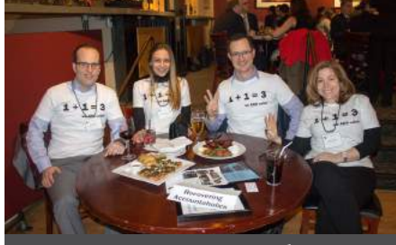
"Recovering Accountaholics" from Collins Barrow