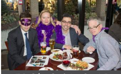
"My Other Outfit is a Onesie" from Gowling WLG LLP