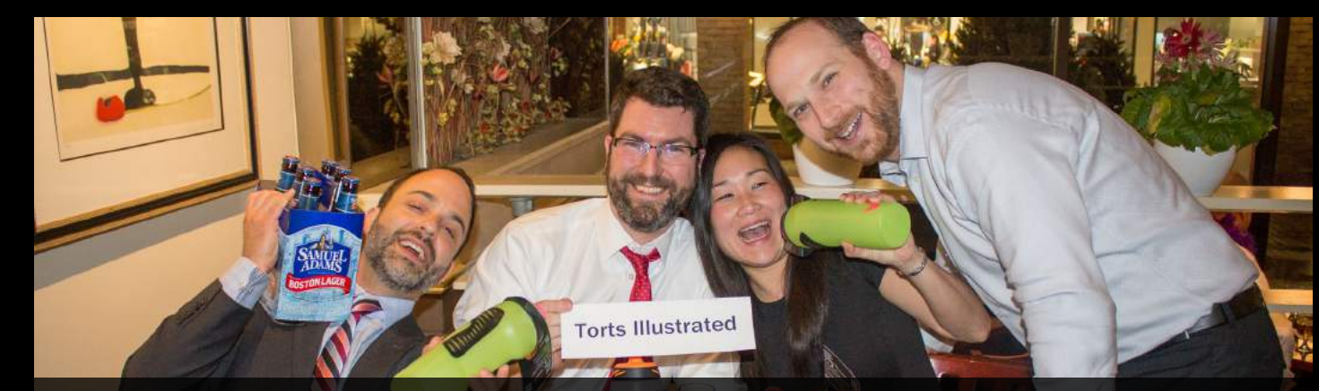
"Torts Illustrated" from Dutton Brock LLP took home the Trivia Challenge Cup for 2016!