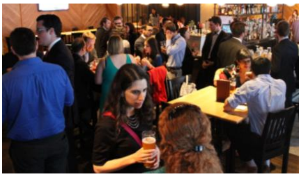
Toronto Pub Night - May 7