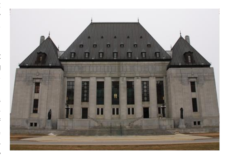
Sources <sup>1</sup> 2014 SCC 71 [ Bhasin ]. <sup>2</sup> 2015 SCC 10 [Potter].

The Supreme Court of Canada reiterated that there is a The Supreme Court appears to be emphasizing its eager-