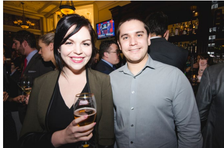
Lawyers mix & mingle at Toronto Pub Night January 2016