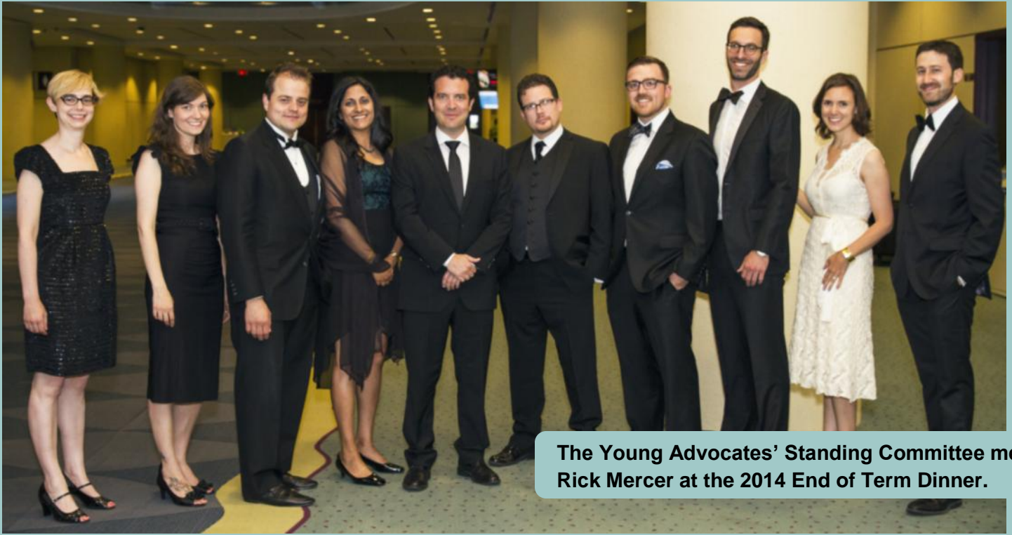
The Young Advocates' Standing Committee meets Rick Mercer at the 2014 End of Term Dinner.