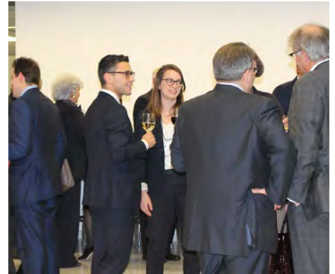
Civil Trials Symposium, January 2015