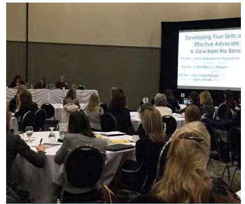
Women in Litigation Conference, Ottawa, March 2015