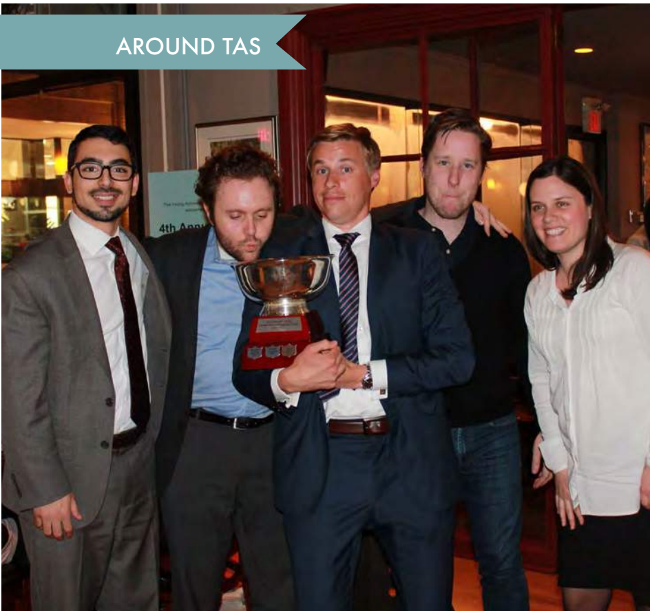
March 2015 Trivia challenge winners "Criminal Minds" aka Henein Hutchison LLP