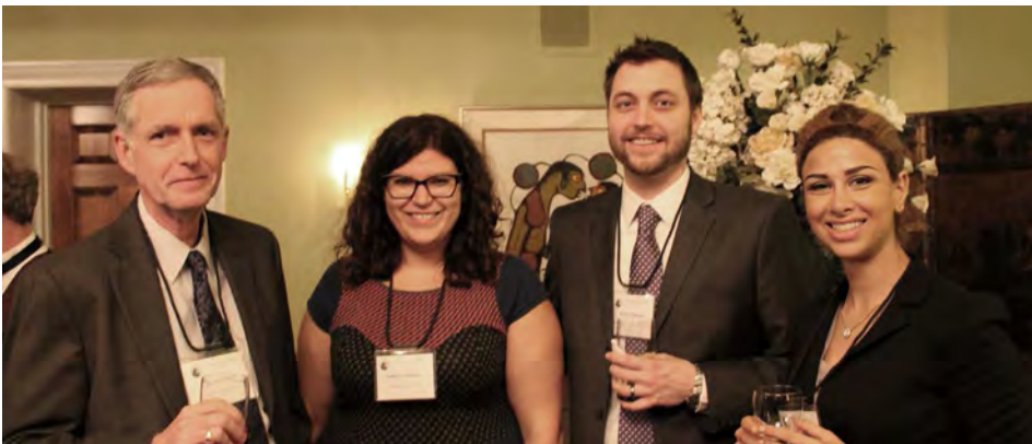
Ottawa Winter Festive, January 2015