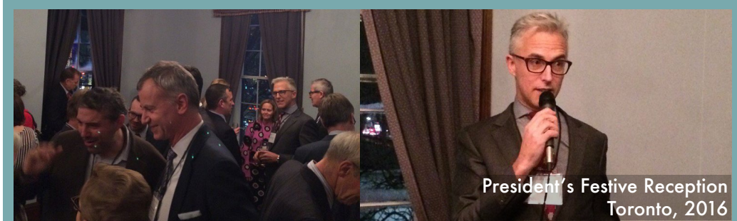
President's Festive Reception Toronto, 2016

National outreach: In 2016, we grew our membership to over 5,500 people. The Society ran programs in Halifax, Calgary and Vancouver, as well as throughout Ontario.