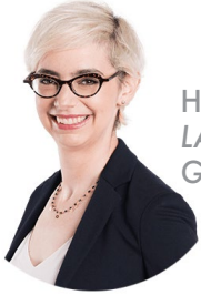
HILARY BOOK, LAX O'SULLIVAN LISUS GOTTLIEB LLP

Complete the 9-letter words in each table using the 3-letter segments below each puzzle. Each segment is only used once. The first word has been completed as an example. When you are finished, the leftover segments can be rearranged to form a Latin phrase. Be the first to send all three phrases to jared@advocates.ca , and you will win a Starbucks Gift Card.