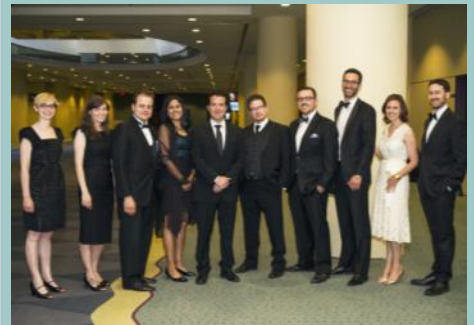
YASC Flashback: Which one of these is not like the other?

Not a Society member? Click here to join now.