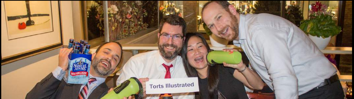
"Torts Illustrated" from Dutton Brock LLP took home the Trivia Challenge Cup for 2016!

Sudbury Law | Interview | Art Law | Around TAS | Upcoming Events