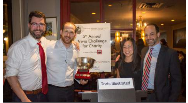
"Torts Illustrated" from Dutton Brock LLP take home the cup for 2016