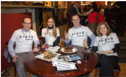
"Recovering Accountaholics" from Collins Barrow