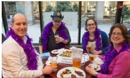
"Inglorious FactNerds" from Gowling WLG LLP