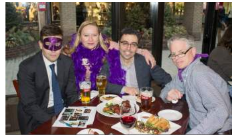
"My Other Outfit is a Onesie" from Gowling WLG LLP